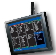
Kitchen Video System