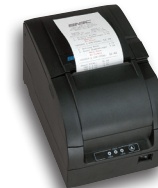
Impact Kitchen Printer