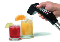
Liquor Dispenser Control