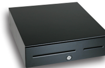
CRS Cash Drawer