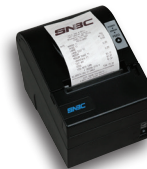
Thermal Receipt Printer

Choose from thermal or impact workstation and remote order printers.