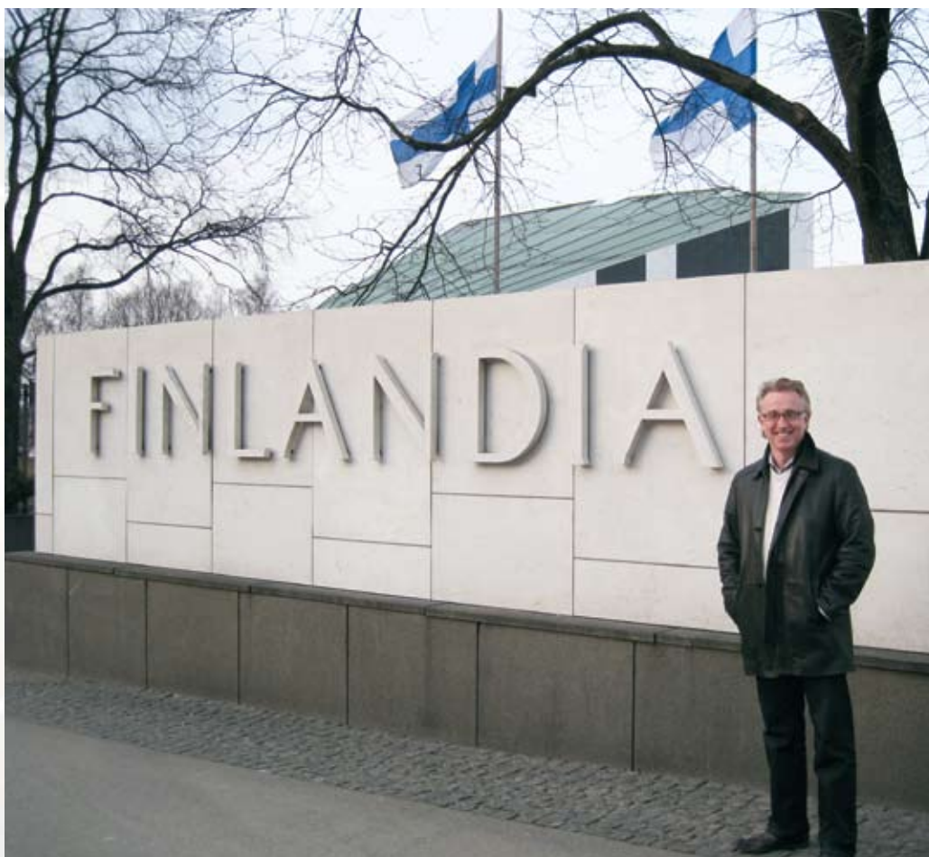
No, Not a Vodka Factory – Finlandia House a National Landmark in Helsinki

Most of the population resides in the south around Helsinki although this thins out rapidly as you travel further north into Lapland (right into the Arctic Circle). However, even with only 5 million people there are, relatively speaking, a lot of molders in Finland, many of whom are working in water treatment, OEM components for agricultural vehicles, marine related products and general industrial molding. Eco-friendly laws have encouraged the development of sewage and water recycling systems and the Finns have embraced this as part of their advanced way of living, and this has spawned a number