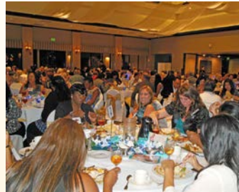
Moms of His Nesting Place