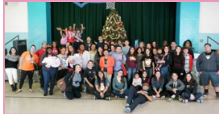
His Nesting Place mothers and children at St. Dominic Savio Christmas Eve Party