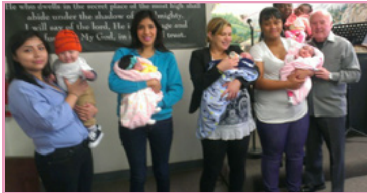
5 newborns (4 born within the last 30 days)