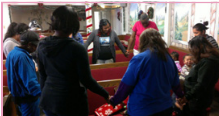
Mothers daily morning prayer in devotions