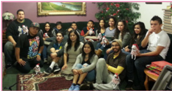
Christmas Volunteers (Gift Wrappers) from Centro de la Palabra Church