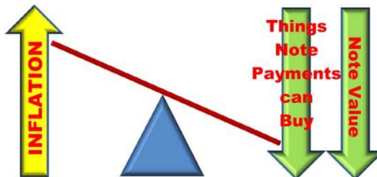
Illustration 2: Inflation reduces a loan's value

As inflation rates rise, the amount of goods and services a payment can purchase goes down