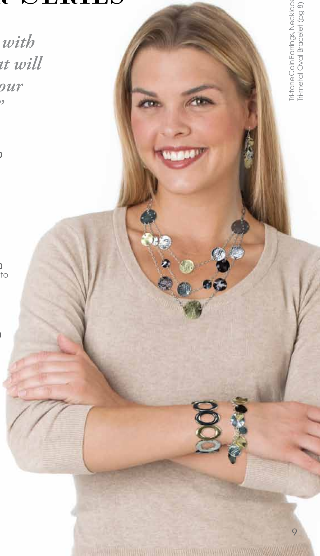
Tri-tone Coin Earrings, Necklace & Bracelet, Tri-metal Oval Bracelet (pg 8)

Stretch gold, silver and hematite color ovals. 1-1/4" wide, one size fits most.