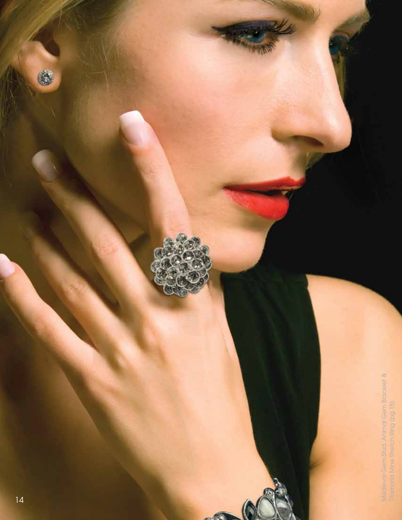
Medieval Gem Stud, Animal Gem Bracelet & Diamond Mine Stretch Ring (pg 15)