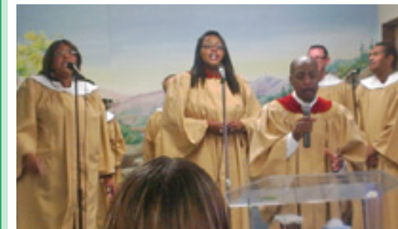
Singing a solo

Email: hnp@hisnestingplace.org www.hisnestingplace.org