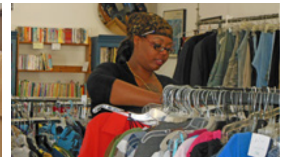
Working at Thrift Store