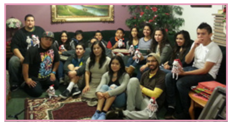
Christmas Volunteers (Gift Wrappers) from Centro de la Palabra Church