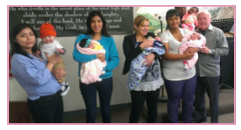
5 newborns (4 born within the last 30 days)